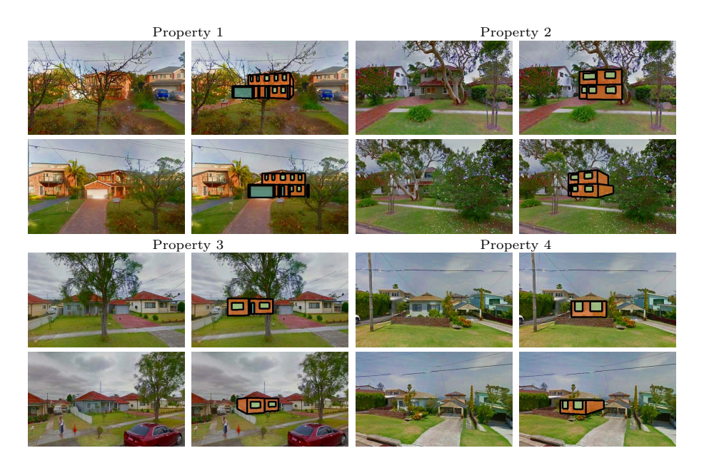
Fig. 6: Our approach demonstrates robustness when the house is occluded. Left: original images (two for each house). Right: our results.

Impact of search space discretization: We study the impact of the size of the search range for the building's xy position in Tab. 4. There is a trade-off between efficiency and efficacy. As we increase the search range, the percentage of ground-truth samples located within the search range increases, and building position accuracy also increases. However, above a certain range the accuracy starts to drop since more ambiguous samples are included. Tab. 5 shows the impact of different quantization thresholds for the height variables. Supplementary material investigates more discretization choices.