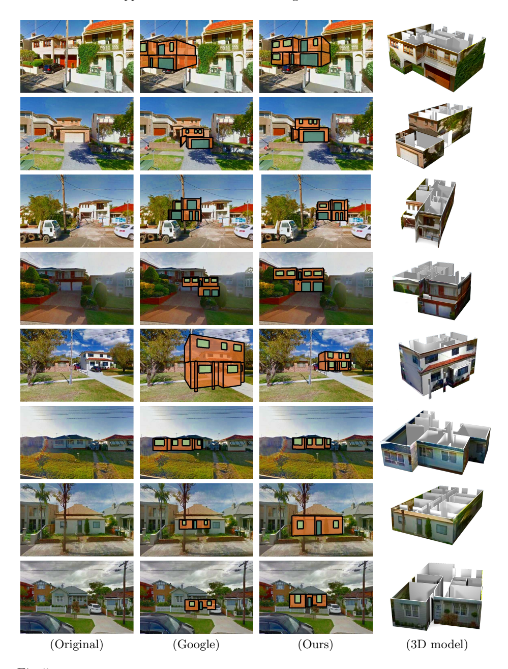
Fig. 5: Qualitative comparison. From left to right: input StreetView image, baseline method, our approach, texture-mapped 3D house model using our result.

precision/recall of each stage without taking into account previous errors, i.e., objects that are missed by the proposal are excluded for detection.