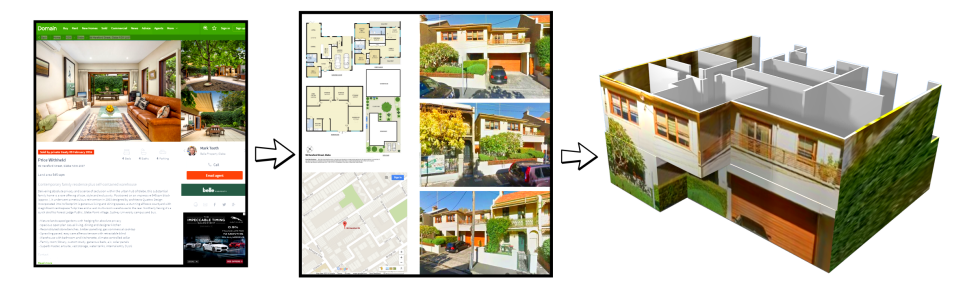
Fig. 1: We exploit rental ads and a small set of (wide-baseline) Google's StreetView images to build realistic textured 3D models of the buildings' exterior. In particular, our method creates models by using only the (approximate) address and a floorplan extracted from the rental ad, in addition to StreetView.

Keywords: 3D reconstruction, 3D scene understanding, localization