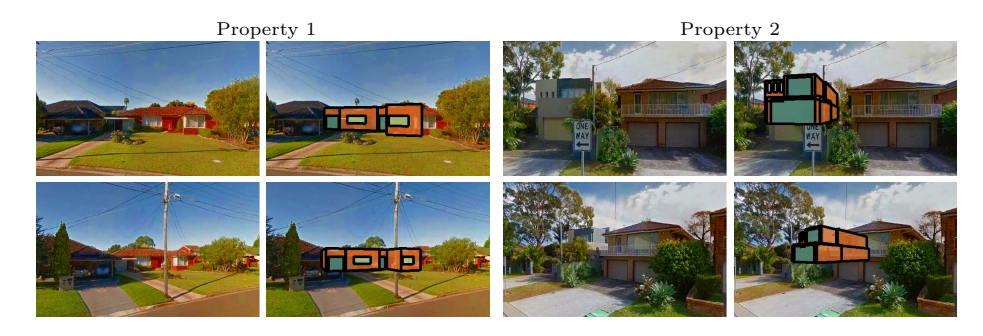
Fig. 7: Failure modes. Left: original images. Right: our results.

Failure modes: Fig. 7 shows a few failure modes. In property 1, our approach fails because the initial building position is too noisy. The ground truth is 16.3m from the initial position, which exceeds our 20 \times 20 search range. Property 2 shows another difficult case, where the building is heavily occluded in the second and third view, the facade has similar color to the sky, and many non-building edges exist. In this case, our method still estimates the building xy position correctly, but fails to estimate the vertical positions.