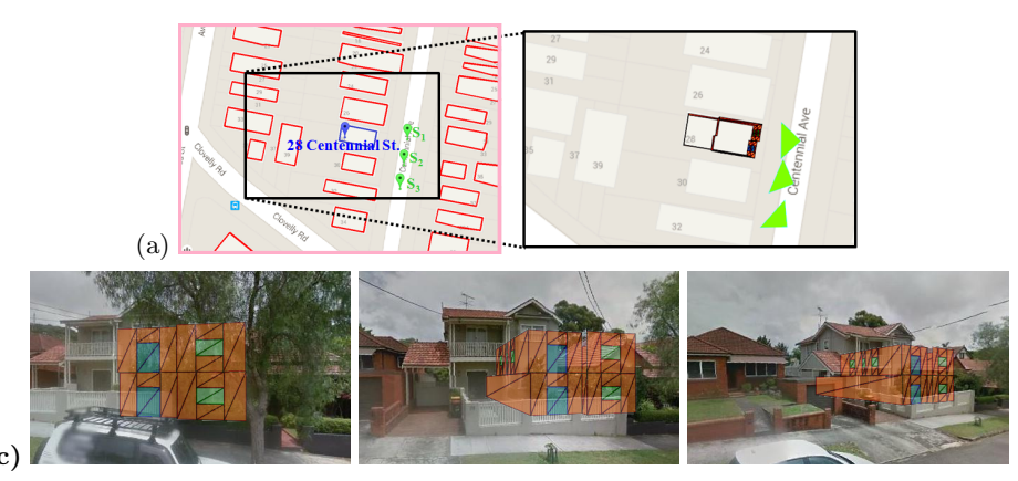
Fig. 2: The initial building's position and StreetView images. In (a), blue pin shows the geo-reference result, green pins show three nearby StreetView images S_{1,2,3} , red lines depict the building contours parsed from the map image. (b): Building's floorplan placed on the map. (c) shows StreetView images corresponding to S_{1,2,3} in (a), respectively, overlaid with the virtual house rendered with the initial building position (from (b)) and floor, door, window heights as 1m, 2m, 3m.