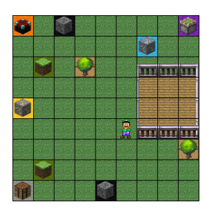
Figure 1: Minecraft-inspired domain containing natural resources, buildings where they can be processed, and perils such as zombies (adapted from [Andreas et al. , 2017]).

Tabular q-learning [Watkins and Dayan, 1992] learns policies by learning to approximate the optimal q-function. An approximate q-function \tilde{q}(s, a) is initialized in some manner