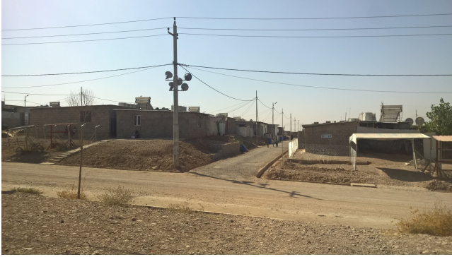
Figure 2: Refugee-built concrete shelters in Darashakran