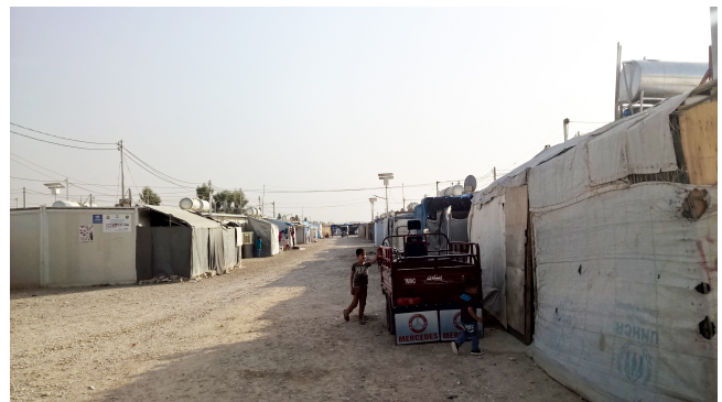
Figure 4: A street in the caravan district in Baharka

Baharka IDP camp (Figure 4) is located 10km north of Erbil and was founded on June 10th, 2014. Baharka was originally a transit point for Syrian refugees, then to Iraqi IDPs fleeing ISIS hostilities in the summer of 2014. It currently houses 4,164 IDPs on 283,165m 2 of land. Baharka is run by the Barzani Charity Foundation (BCF), a Kurdish charity based in Erbil, in partnership with other organizations such as the UNHCR and the WFP [45]. A survey from April 2016 [28] reveals that 82% of 997 shelters are tent on cement base (i.e. tent with concrete kitchen, shower, and latrines akin to Darashakran and Kawergosk) and 18% are caravans.