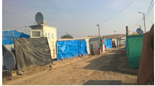
Figure 3: Modified tents in Kawergosk with a communal WC

Kawergosk refugee camp was founded on August 15th, 2013 25km south of Erbil City. This permanent camp is smaller than Darashakran, occupying 419,000m 2 of land, with the majority of the space being used for makeshift tents that serve as housing for the residents. It has 9,234 registered refugees, also majorly of Kurdish origin from Qamishli. Key organizations actively involved with maintaining