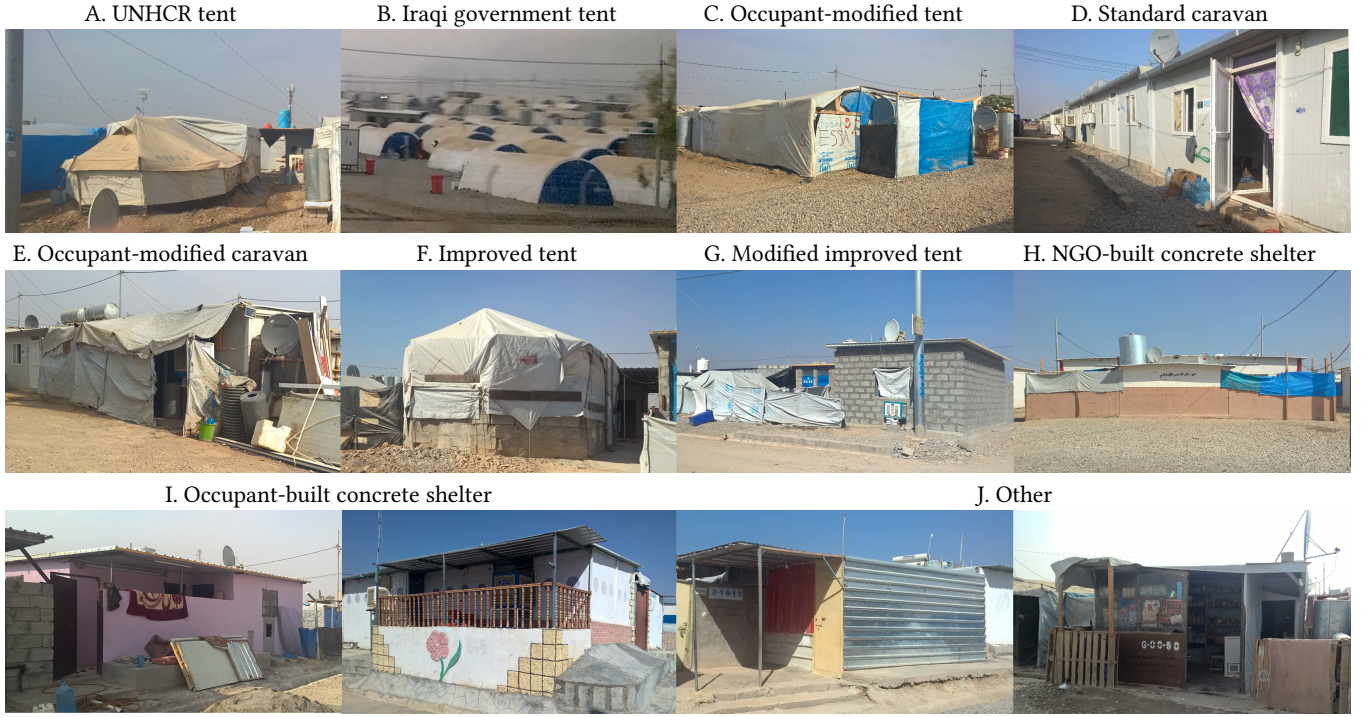
Table 1: Shelter types in North Iraqi camps