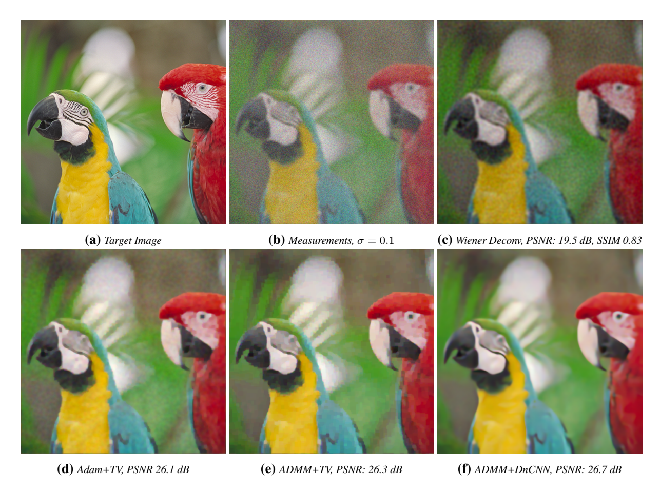
Figure 3: Results. A target image (a) is degraded by blurring it and corrupting the measurements with additive Gaussian noise with \sigma = 0.1 (b). Conventional approaches, including Wiener deconvolution fail at estimating a high-quality reconstruction (c). The Adam solver of the PyTorch package combined with an isotropic TV regularizer does a much better job at recovering the image (d). The ADMM solver with a TV regularizer achieves somewhat comparable results to Adam (e). However, ADMM is flexible in allowing arbitrary denoisers to be used as regularizers, such as DnCNN. For this example, ADMM with DnCNN (f) achieves the best results both qualitative and quantitatively, as measured by the peak signal-to-noise ratio (PSNR).

one may expect. Qualitatively, the TV norm creates sharp edges but also usually results in a "patchy" appearance, which is promoted through the piecewise constant intensity regularizer and expected. The DnCNN regularizer can reduce noise and patches in the estimated image and this result looks like the most natural of all of these reconstructions. Yet, there is no magic in any of these approaches as none can recover the high-frequency details of the target image that are irreversibly lost by the blur kernel, which acts as a low-pass filter. The only way to "restore" them is to hallucinate them, for example using a generative adversarial network (GAN).