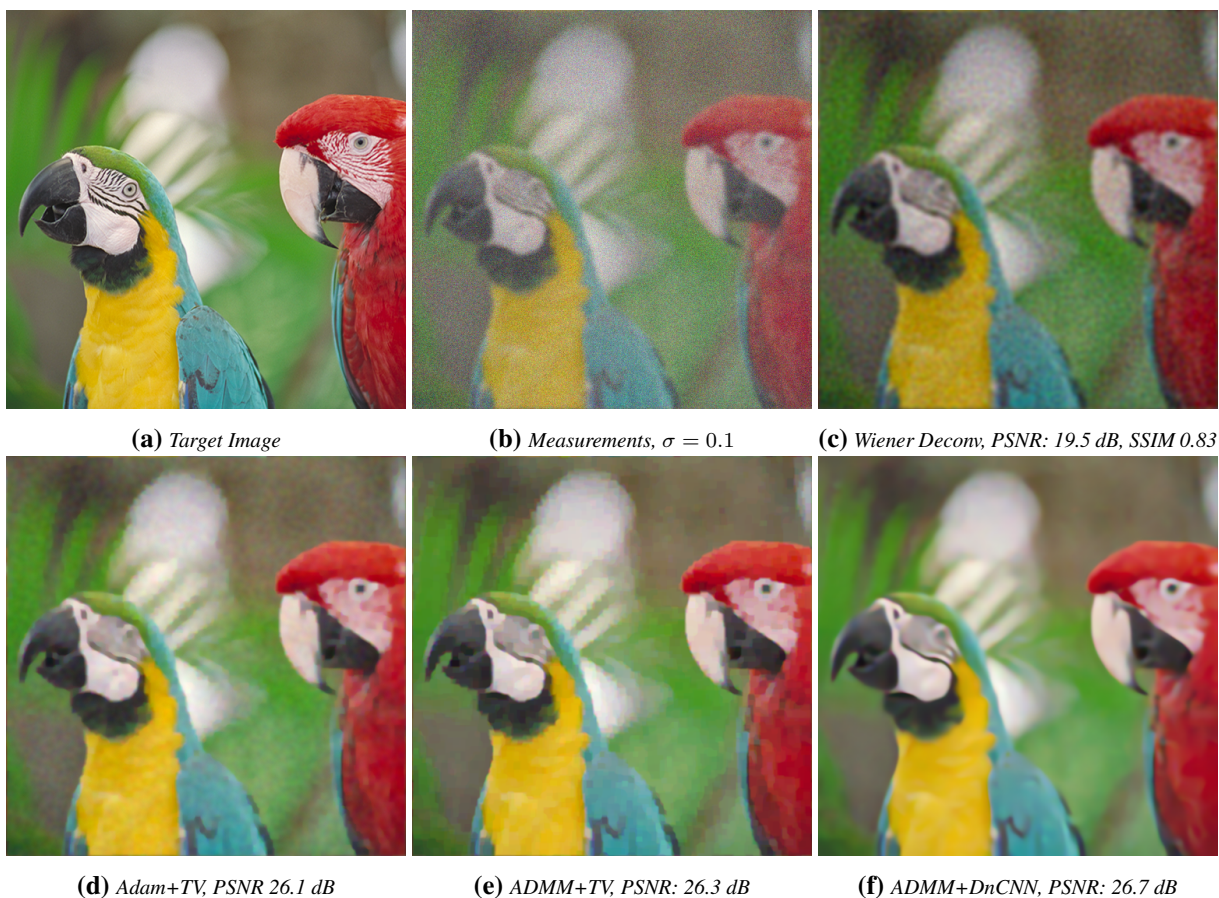
Figure 3: Results. A target image (a) is degraded by blurring it and corrupting the measurements with additive Gaussian noise with \sigma = 0.1 (b). Conventional approaches, including Wiener deconvolution fail at estimating a high-quality reconstruction (c). The Adam solver of the PyTorch package combined with an isotropic TV regularizer does a much better job at recovering the image (d). The ADMM solver with a TV regularizer achieves somewhat comparable results to Adam (e). However, ADMM is flexible in allowing arbitrary denoisers to be used as regularizers, such as DnCNN. For this example, ADMM with DnCNN (f) achieves the best results both qualitative and quantitatively, as measured by the peak signal-to-noise ratio (PSNR).

one may expect. Qualitatively, the TV norm creates sharp edges but also usually results in a “patchy” appearance, which is promoted through the piecewise constant intensity regularizer and expected. The DnCNN regularizer can reduce noise and patches in the estimated image and this result looks like the most natural of all of these reconstructions. Yet, there is no magic in any of these approaches as none can recover the high-frequency details of the target image that are irreversibly lost by the blur kernel, which acts as a low-pass filter. The only way to “restore” them is to hallucinate them, for example using a generative adversarial network (GAN).