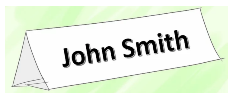
\label{lem:figure 1: From https://www.wikihow.com/Make-a-Temporary-Personal-Nameplate-for-an-Office-Desk-or-Computer} \\

▶ You: Create a "name card" so I can learn your name