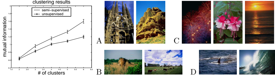
Figure 2: Hierarchical clustering of natural image categories. (left) Mutual information between reduced cluster index and original class. (right) Sample images from the sets A,B,C,D learned by hierarchical clustering.

description (e.g. fields, sunset). For each pixel we extract a five-dimensional feature vector (3 color features and x,y position). From all the pixels that are belonging to the same category we learn a single Gaussian. We have clustered the image categories into k = 2, \dots, 6 sets using our algorithm and compared the results to unsupervised clustering obtained from an EM procedure that learned a mixture of k Gaussians. In order to evaluate the quality of the clustering in terms of correlation with the category information we computed the mutual information (MI) between the clustering result (into k clusters) and the category affiliation of the images in a test set. A high value of mutual information indicates a strong resemblance between the content of the learned clusters and the hand-picked image categories. It can be verified from the results summarized in Figure 2 that, as we can expect, the MI in the case of semi-supervised clustering is consistently larger than the MI in the case of completely unsupervised clustering. A semi-supervised clustering of the image database yields clusters that are based on both low-level features and a high level available categorization. Sampled images from clustering into 4 sets presented in Figure 2.