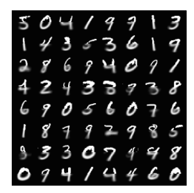
Figure 1: An example of the observed data (left) and the predictions about the missing part of the image (right).

This can be written out as the following generative process: