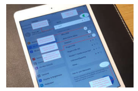
Fig. 3: Overlay Modal, presenting Wi-Fi help.

Strategies for 'training wheels' modes in programs [5] that involve blocking typical side tracks and error states are effective in facilitating the applied learning of unfamiliar interfaces. Related work in this space shows similar solutions to the problem of technology adoption. HelpMe [9] presents users with contextual help tooltips in an overlay, and an on-screen invocation button is revealed after a period of user inactivity. In the design of this prototype, the help button is always available, to convey