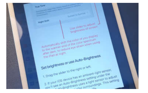
Fig. 4: Documentation Modal, presenting Display help.

The documentation modal works by providing the user with information in a form factor that relays the metaphor of a user manual. Upon invoking the help button, the documentation modal provides users with a description of the interface, a labeled overview of the interface elements, and step-by-step instruction for the task associated with the view.