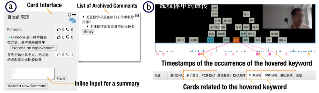
Fig. 2. (a) The card widget interface where viewers write summaries or propose changes to summaries. The list of archived comments can be invoked by clicking on the \ icon. (b) The keywords visualizations allow viewers to explore the content of the stream. Hovering the cursor over a keyword visualizes when the keyword appeared in the summaries or archived comments and also highlights the cards related to it.

To enable such a workflow, we designed a card widget as a shared visual medium, which all viewers can write summaries on (Fig. 2a). The widget has an inline text input field which appears when needed. The most recently added card can be moved around by dragging the mouse. The previously added cards are shown at the bottom of the window, ordered chronologically (Fig. 1e). Viewers can read summaries and archived comments on these cards and add content to them. The cards can also be minimized to only show their titles when not needed.