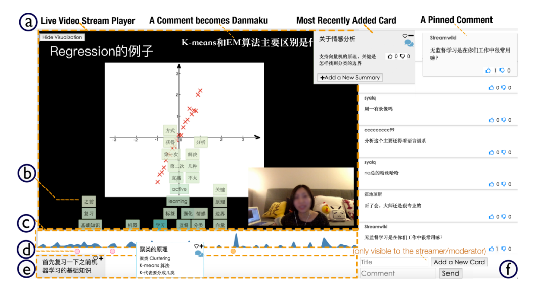
Fig. 1. StreamWiki web interface. (a) Live video stream player. (b) Real-time keyword visualization of the summaries and archived comments. The horizontal position of the keyword indicates the average time at which it occurred. (c) Real-time visualizations of the volume of comments from viewers. (d) Timestamps of cards shown on the timeline. (e) Previously added cards, ordered chronologically. (f) The Comment Window.

Based on the findings from the interviews and the design goals, StreamWiki was designed to support knowledge sharing via live streaming. We used an iterative process throughout the design, involving the streamers, moderators, and viewers we interviewed to get their opinions on the design. StreamWiki adds two elements to live video: the ability to gather input from viewers and the ability to display context information written and organized by the viewers. Viewers can add summaries of the content and give feedback on comments and summaries while watching the live video. Content summaries are displayed and updated in real time during the live stream so that all the viewers can better understand the current context. After the live stream, the summaries and the comments become a summary document with the archived video that can not only help viewers understand the content, but also provide a way to navigate the archived video.