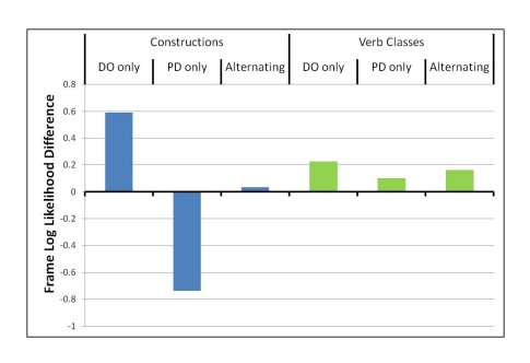
Figure 2: The difference between the log-likelihood values of the DO and PD frames, given each of the three input conditions: DO only, PD only, and Alternating. Values above zero denote a higher likelihood for the DO frame, and values below zero denote a higher likelihood for the PD frame.

We examine the generalization patterns of our model when presented with a novel verb in DO/PD forms after being trained on 15,000 inputs, which we compare to the performance of adults in such