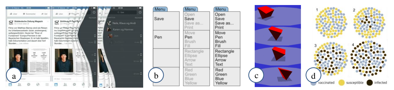
Figure 3 - Illustration of (a) Role 12 : animation is used to simulate a curtain effect when sliding a window to reveal underneath content on a mobile phone – © M. Ekert; (b) Role 14 : ephemeral adaptation progressively reveals content in menus based on history – Adapted from [19]; (c) Role 19 : Polly is a walking prism whose motion conveys a mood – © K. Perlin; (d) Role 23 : animation shows how flu spreads in a population of vaccinated (blue) and vulnerable (yellow) children – Adapted from The Guardian.

gered animations, which consist of introducing a small delay in the motion start time of elements, aim to recreate the feel of ballet choreography [12].