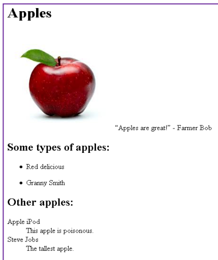
Figure 3: Default rendering

2.- Figure 3 shows the default rendering of the HTML code shown in 4. Draw a similar picture showing how the page would be rendered once the styles shown in Figure 5 are applied.