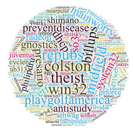
Figure 2: The top 10 words for each word embeddings' dimension.

Given the sparsity of word embeddings, one natural question would be: What are those key words that are leveraged by the model to make predictions? To this end, after training SWEM-max on Yahoo! Answer dataset, we selected the top-10 words (with the maximum values in that dimension) for every word embedding dimension. The results are visualized in Figure 2. These words are indeed very predictive since they are likely to occur in documents with a specific topic, as discussed above. Another interesting observation is that the frequencies of these words are actually quite low in the training set (e.g. colston: 320, repubs: 255 win32: 276), considering the large size of the training set (1,400K). This suggests that the model is utilizing those relatively rare, yet representative words of each topic for the final predictions.