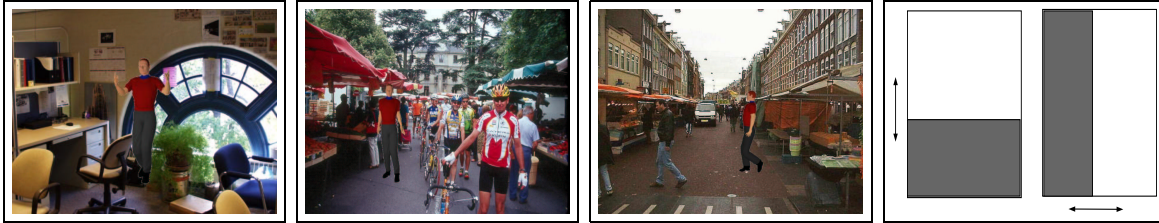
Figure 1: Examples of images included in our training database that consists of synthetically generated poses (from motion capture) rendered on natural indoor and outdoor image backgrounds. The rightmost plot shows masks used to generate partial occlusion within the detection window (regions shown in gray) views. We use only simple combinations restricted to intermediate horizontal and vertical positions, but more complex arrangements are possible.