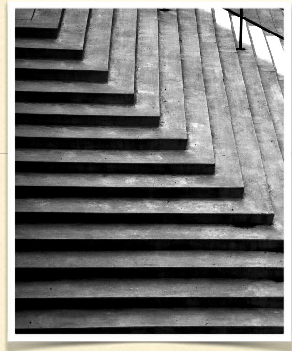
Steps, pawpaw67, flickr.com