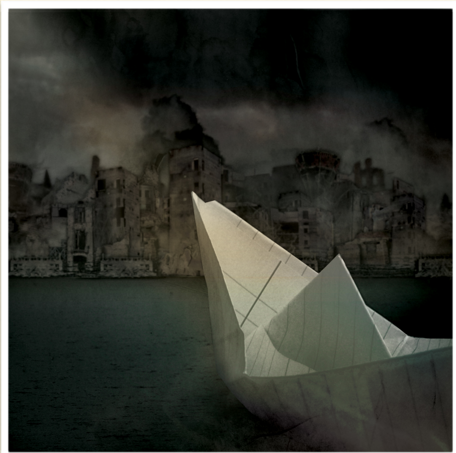
Sensitive Noise, Milos Milosovic, flickr.com