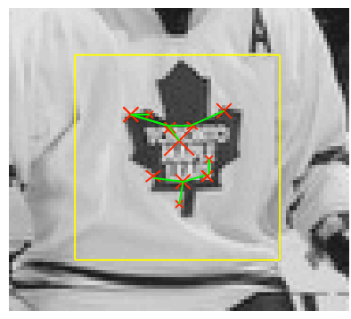
Figure 3. Detection of a model associated with the Toronto Maple Leafs. Observed vertices are in red; edges in green.