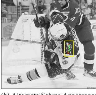
(b) Alternate Sabres Appearance