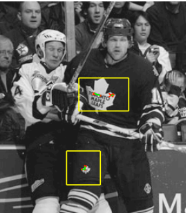
(a) Variations in Scale

appearance depending on viewing angle and pose. A model that captures the appearance of the front logo will not help annotate a view of a player from the side.