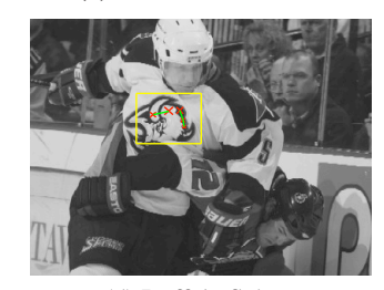
(d) Buffalo Sabres