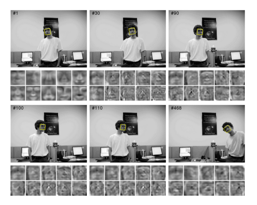
Fig. 2. Tracking an object undergoing a large pose variation (See video at http://www.cs.toronto.edu/~dross/ivt/).

panels) though a few eigenvectors still contain high frequency noise. As this target changes its pose, the updated subspace also accounts for the variation in appearance (see the first three eigenvectors in upper middle panel). Finally with enough samples, the subspace has been updated that capture more facial details of this individual (lower three panels). Notice that the proposed algorithm tracks the target undergoing large pose variation. On the other hand, the eigentracker with a fixed eigenbasis fails as this person changes pose. Though the eigentracker can be further improved with view-based subspaces, it is difficult to collect the training images for all possible pose variations. We note that all the other three trackers mentioned above fail to track the target object after a short period of time, especially when there is a large pose variation. The fixed template tracker fails during the first out-of-plane rotation of the subject's face. In this video, the two-view tracker quickly drifts away from the subject's face, instead tracking the side of his head.