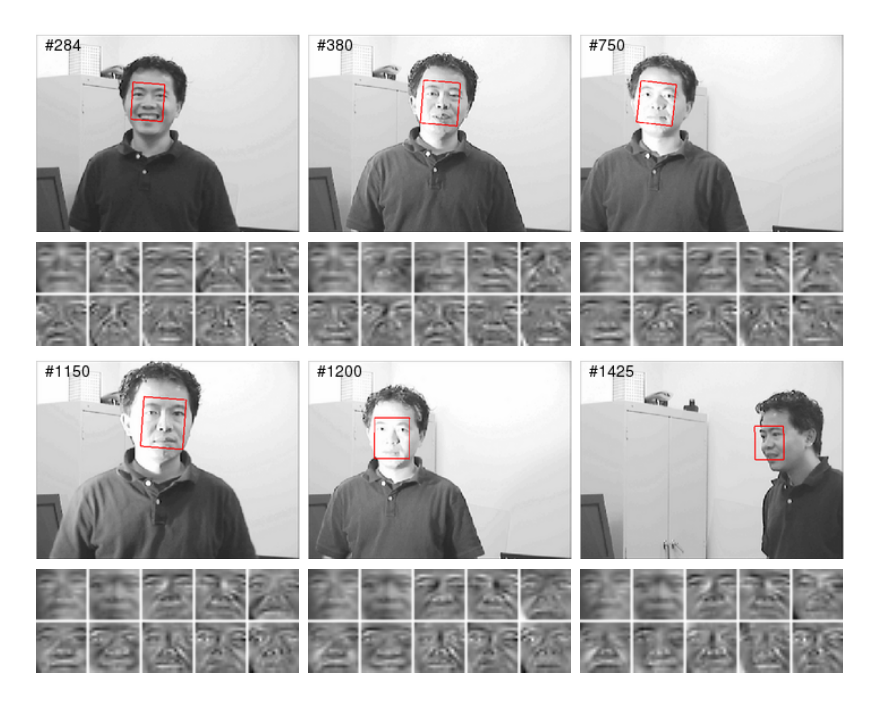
Fig. 3. Tracking an object undergoing a large appearance, pose, and lighting variation (See video at http://www.cs.toronto.edu/~dross/ivt/).

drastic lighting change that changes the facial appearance in the second, third, and fourth panels. Our tracker is still able to follow the target object in these situations. On the other hand, both the eigentracker and template tracker fail to track the object when there is large lighting variation (starting from the middle panel). The two-view tracker suffers during the scale change in this sequence, drifting to track a small subregion of the face as the subject approaches the camera. Finally, the proposed algorithm is able to track the target object under a combination of lighting, expression and pose variation (lower right panel).